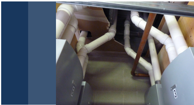
Tankless water heaters vented to outdoors with PVC piping

If the hot water demand is beyond the capacity of the primary appliance, a signal is sent to one or more of the secondary appliances to ignite. The primary control appliance is rotated throughout the cascade setup to distribute the load of each unit.